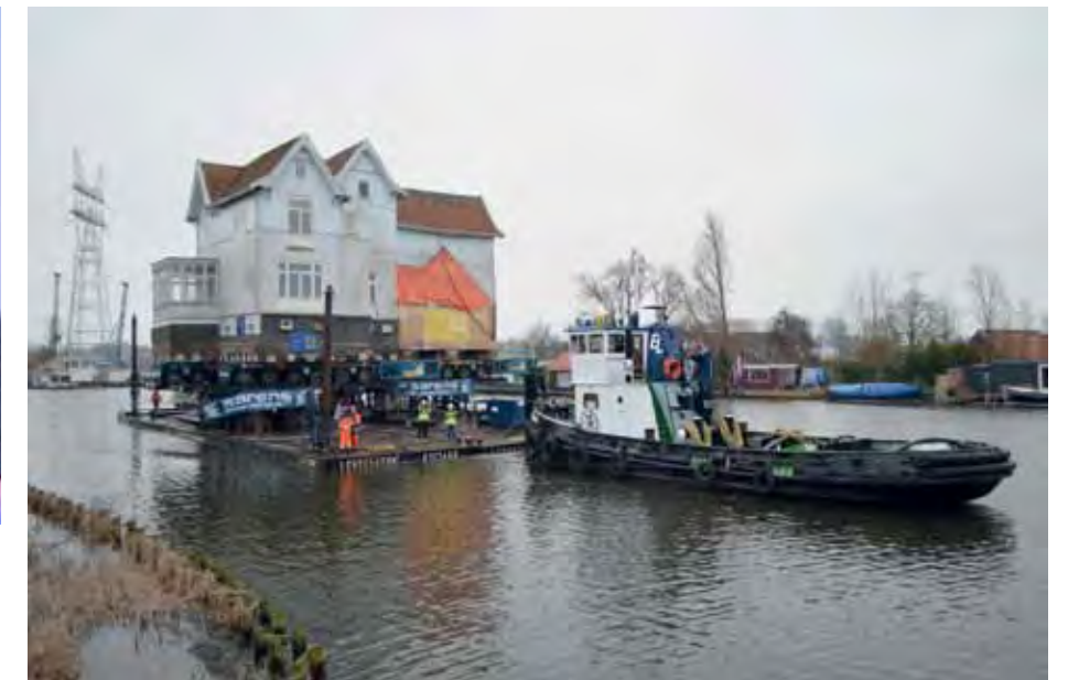
The Dutch minister for Traffic assisted the transport.