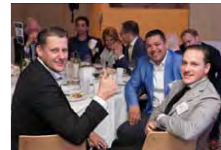
The Van Schaften team.