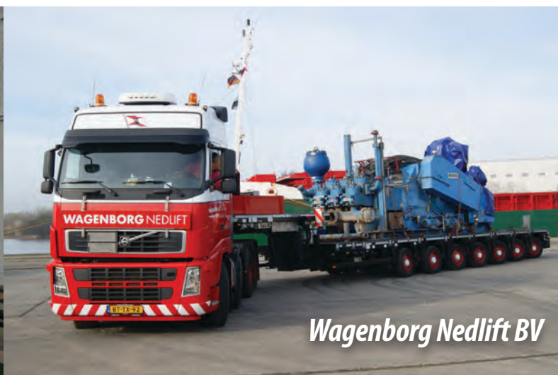
Wagonborg Nedlift BV