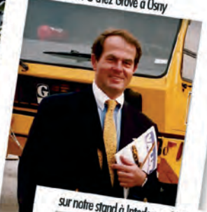
1994 JPO chez Grove à Osny