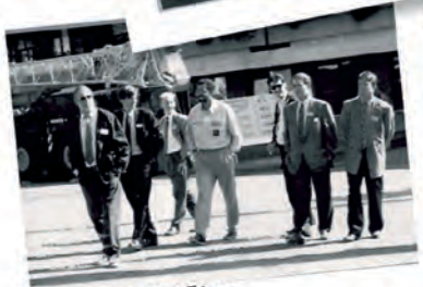
Septembre 1991 visite à Ebingen