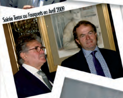
Soirée Terex au Fouquets en Avril 2009