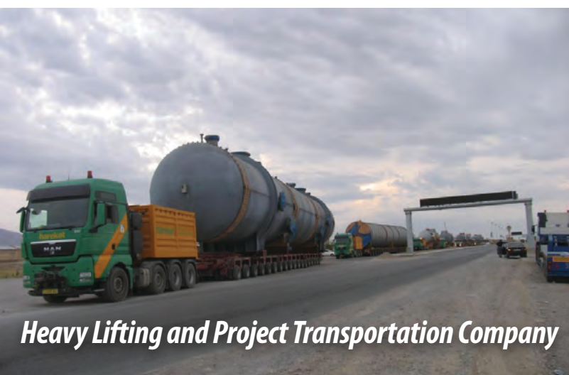
Heavy Lifting and Project Transportation Company