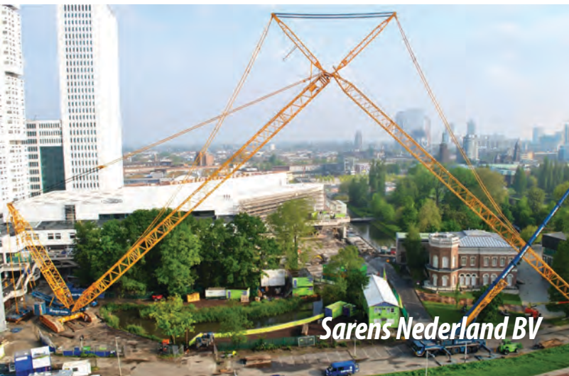
Sarens Nederland BV