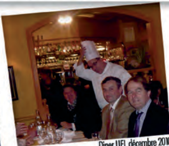
Diner UFL décembre 2010