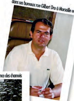
dans ses bureaux rue Gilbert Dru à Marseille en 1989