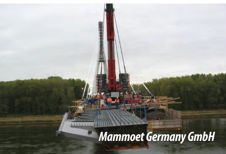
Mammoet Germany GmbH