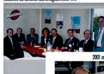
rencontre au sommet des levageurs Avril 1997