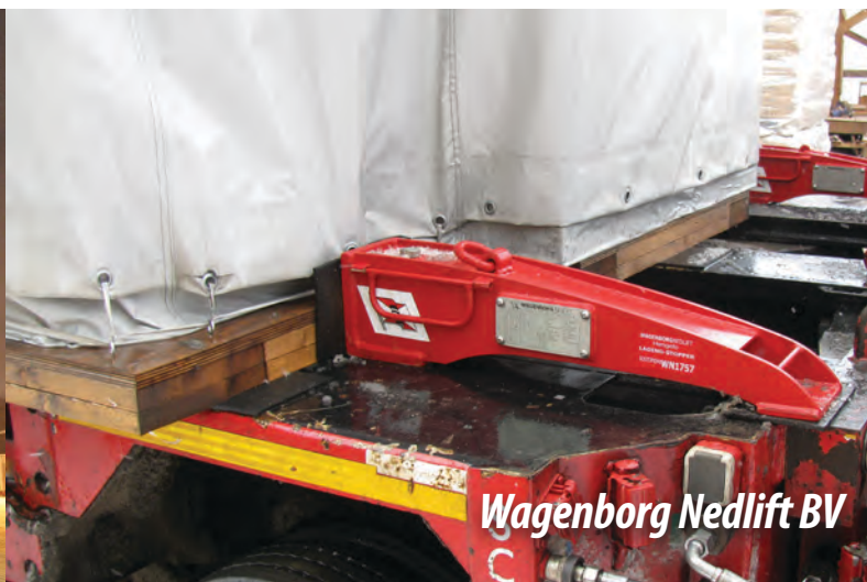
Wagenborg Nedlift BV