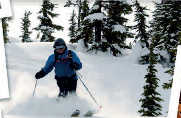
Skieur de très haut niveau, il fut champion de France des chamois