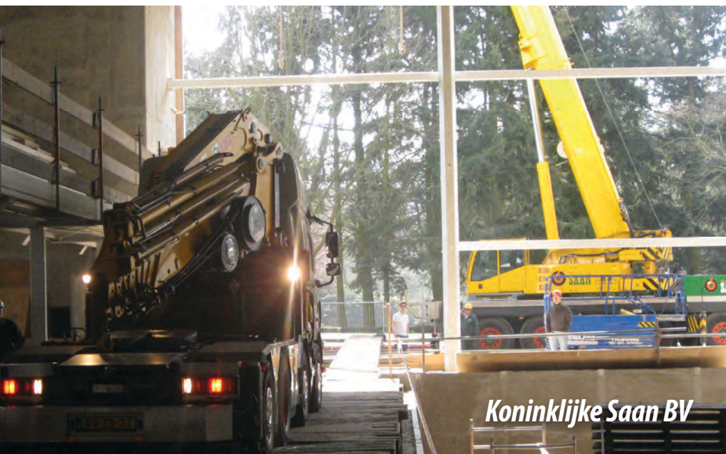
Koninklijke Saan BV