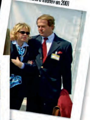
sur notre stand à Interlev en 2001