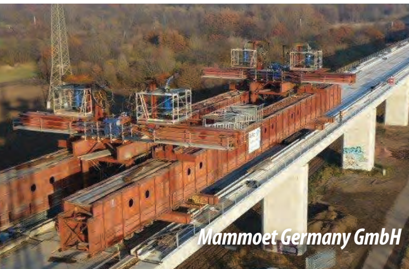
Mammoet Germany GmbH