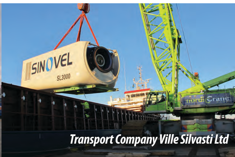
Transport Company Ville Silvasti Ltd