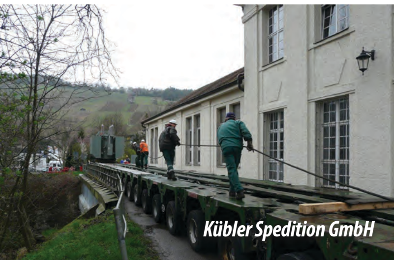
Kübler Spedition GmbH