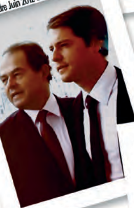
re Juin 2012 à Marseille