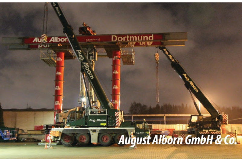
August Alborn GmbH & Co.