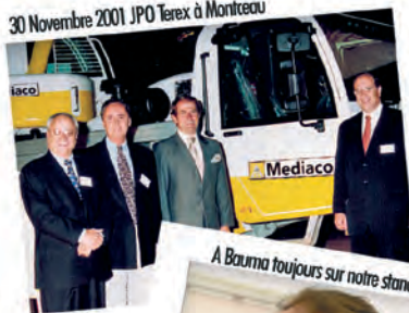
30 Novembre 2001 JPO Terex à Montceau