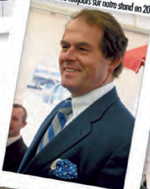
A Bauma toujours sur notre stand en 2001