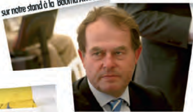
sur notre stand à la Bauma Avril 2007